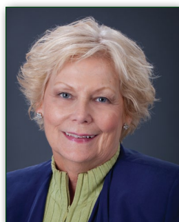
DRE License #01200897

The graphs above reflect the sales of Rossmoor homes from January 1 to March 31st 2014 through 2019 and is obtained from the Rossmoor Realty database and Contra Costa Association of Realtors MLS combined. This information is reliable but not guaranteed.